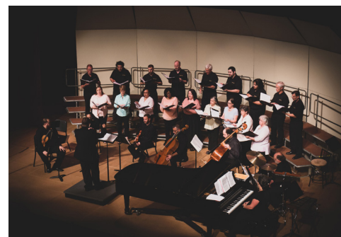
Inspiring Joy and Enriching our Community through Choral Music